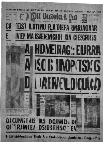
FIGURE 5. Waldemar Cordeiro, Jornal , 1964, Newspaper collage on paper, 65 x 22.5 cm. Image courtesy of Ana Livia Cordeiro.

During this period mass communication was marked by a slippage between what was stated and what was understood, between what was declared and what was intended. Cordeiro’s 1964 work Jornal , a newspaper page constructed of mismatched strips from other newspapers, quite literally portrays the reading between the lines necessitated by the context (Figure 5). Enough of the strips are taken from the same newspaper page that one expects to be able to construct a narrative from parts, but only snatches of clarity are possible. A sufficient part of the structure remains to reveal that the physical construction of a newspaper page is standardized: a newspaper title and publication information stand at the top, above any news, and a descriptive headline falls below, followed by an enormous, eye-catching phrase and photographs. The fact that the page is instantly recognizable